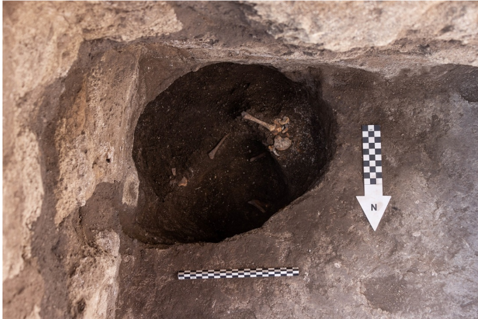
Figure 7. Fetus burial (F. 10176, skeleton: U. 40458) in the corner of Space 710