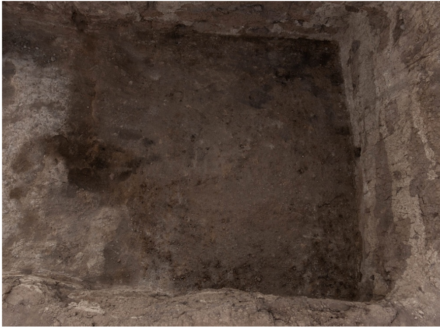
Figure 5. Space 701, B. 173. Make up layer 40410

composed of three elements: (i) the uppermost part of the wall (F.10149; U.40355), followed by (ii) the bench (F.10156) (Figure 6), and (iii) the lowermost part of the wall (F.10086).