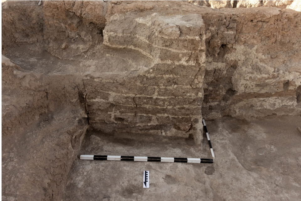
Figure 4. The southern wall of Space 685 (F. 10121), Building 173