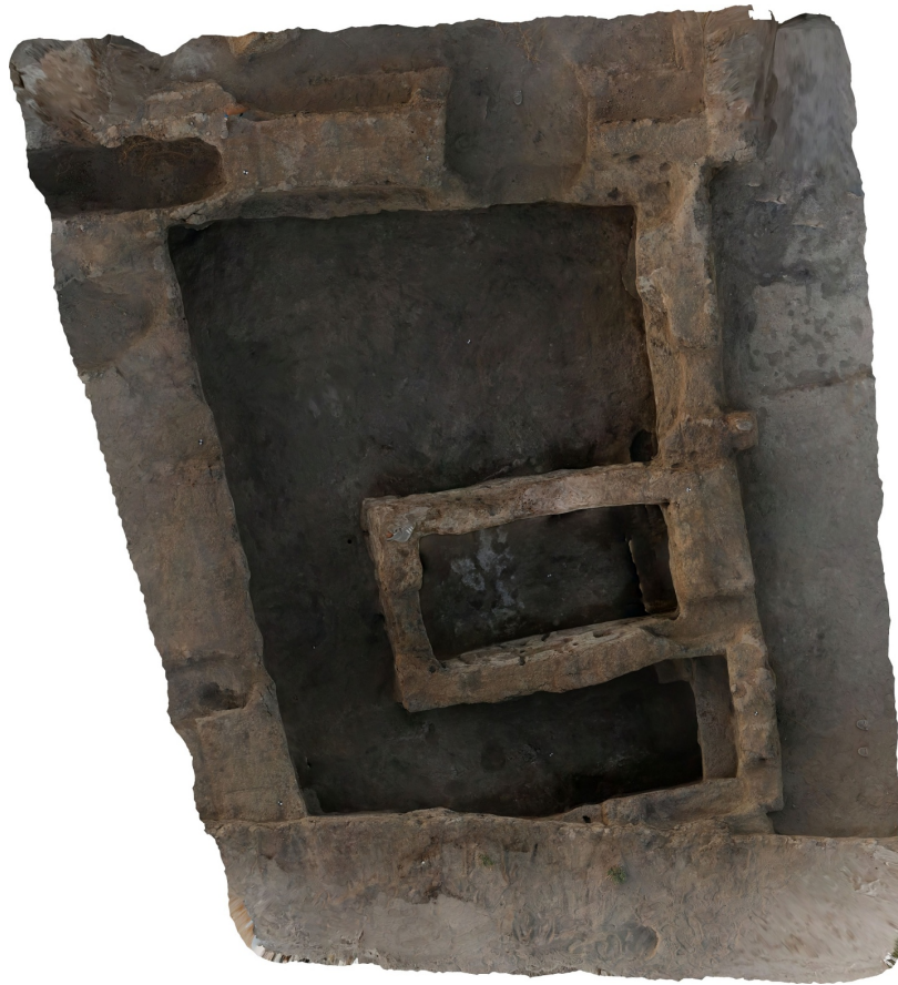
Figure 3. An orthophoto of Buildings 178 and 173.