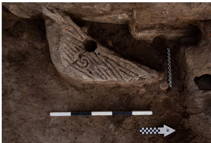
Figure 9. Decorative relief, Building 174

rounded corners. It was carefully plastered and painted white. In the upper part of the pilaster, a small red pigment painting was created. Some decorative elements, most likely functionally related to that wall, were also found. In particular, these comprise two fragments of clay reliefs. The preserved fragment of the first relief has the shape of an irregular square. The relief is made of deep incisions into the clayish matter. Its central part comprises two parallel lines. Three diagonally incised grooves and four diagonal grooves spread out from these two lines (Figure 7). The other incised fragment is smaller and is embedded into the southern edge of the crawl hole.