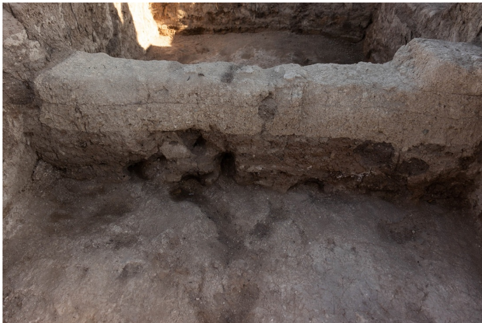
Figure 6. Space 701, bench F. 10156